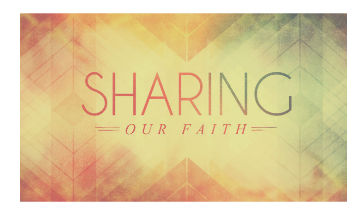
Join us tonight for week 6.

Evangelism Summarized: Question/Answers/ & Testimonies