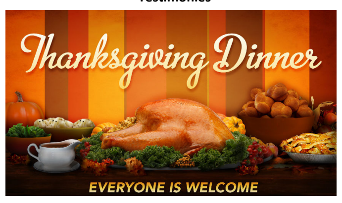
Sunday, November 12<sup>th</sup> after the morning service.

Evangelism Summarized: Question/Answers/ & Testimonies